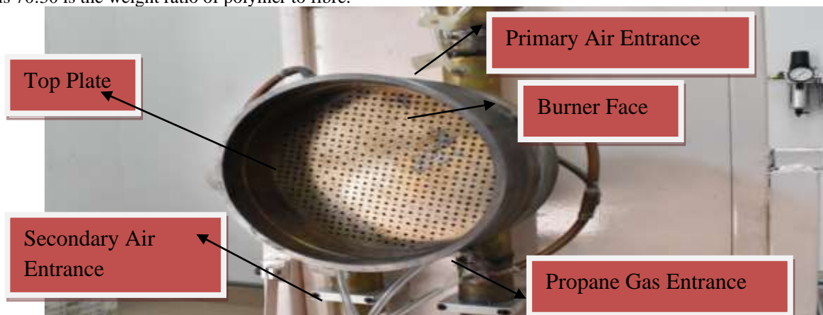
Figure 1: Burner Assembly

After the burner calibration, the fire test commences using a composite of 200mm x 200mm x 4mm each, three samples from each composite were tested and the average results were recorded using a data logger for each sample. The distance between the burner face and the plate sample was maintained at 3-inch, the samples undergo the fire test for 15 minutes. The composite that withstands the 15-minute flame fire was termed as fireproof composite while the one that fails before 15 and after 5 minutes was termed as fire resistant composite. Three K-type thermocouples were used to measure the rear face temperature of the plates; the thermocouples were placed at the centre of each plate, 1½-inches below the centre and 1½-inches left to the centre. Figure1 shows the burner assembly.