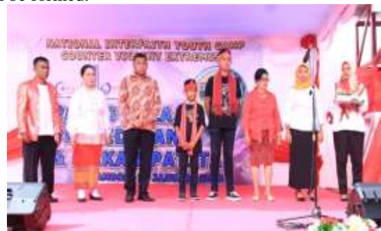
Figure 2. Both schools held Panas Pela of Education on January 29, 2018.

Multicultural education is a cross-border discourse that explores issues regarding social justice, deliberation, and human rights, political, moral, educational and religious issues (Tilaar, 2004). Tilaar further mentioned three sources to achieve a multicultural education curriculum, namely the concept of the needs of students, the concept of community needs, and the concept of the role and status of the subjects to be delivered. From these three concepts, the formulation of a multicultural education curriculum will be formed.