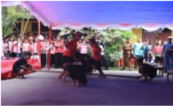
Figure 3. Students from Both Schools Perform Dances

The Pela Gandong relationship between the two schools has been built since 2013 by carrying out a number of joint activities including, sports and art week competitions, scouts, joint iftar, joint Christmas, joint student council activities to teacher exchanges to teach at the two schools. Thus, multicultural education that integrates local wisdom values such as Pela Gandong belonging to the Maluku people has been able to become a typical multicultural education model. In the field of government and politics, Pela Gandong's multicultural education has been included in the Ambon City Government's program in the Regional Medium-Term Development Plan (RPJMD) for 2011-2016 (Fikri & Hasudungan, 2021).