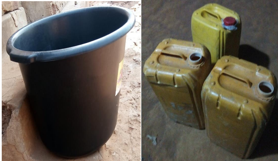
Figure 3: Type of containers used for water collection and their prices Pipe stands owned and managed by the Ghana Water Company Limited, charged by the standard price given (Gh ¢0.30p per “large jerry can” and Gh¢0.20p for the medium and Gh¢0.10p for the “smaller jerry can”). This price, however, increases by Gh¢ 0.10 at the private commercial pipe stands in Kumawu, Bodomase and Besoro for profit for private operators.